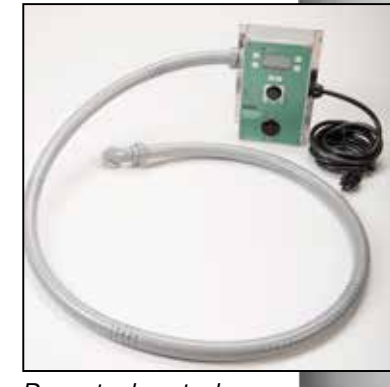
Remote-located control panel