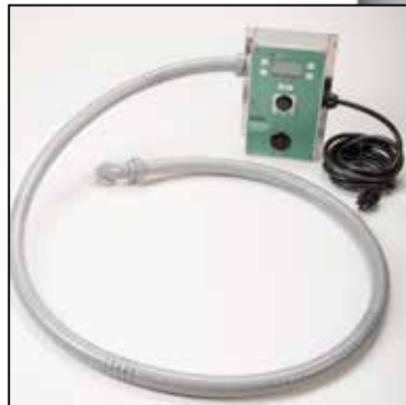
Remote-located control panel